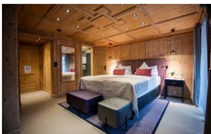
Romantik Hotel Julen

from Hotel Julen, for example, is the perfect place to spend the evenings, with live music, international guests, and a lively atmosphere. The Romantik Hotel Julen offers an authentic and memorable taste of traditional Swiss lifestyle, with many quirky characteristics and a very welcoming vibe.