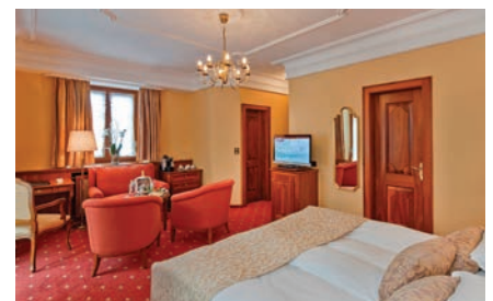
Grand Hotel Zermatterhof Deluxe Double Room