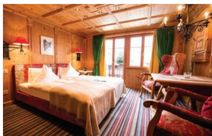
Romantik Hotel Julen Guestroom