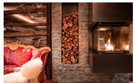
Romantik Hotel Julen