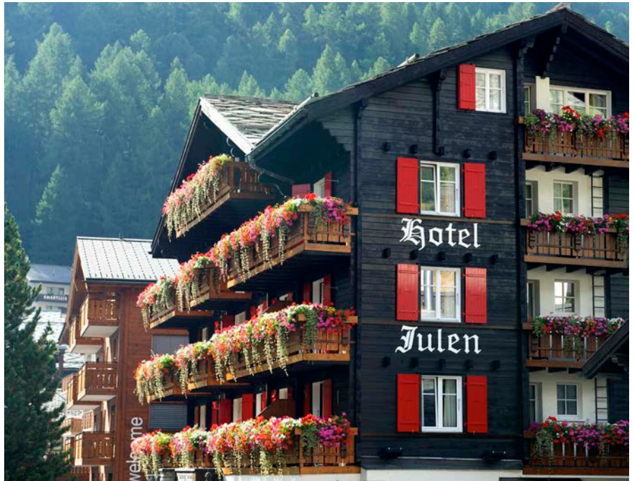
Romantik Hotel Julen

from Hotel Julen, for example, is the perfect place to spend the evenings, with live music, international guests, and a lively atmosphere. The Romantik Hotel Julen offers an authentic and memorable taste of traditional Swiss lifestyle, with many quirky characteristics and a very welcoming vibe.