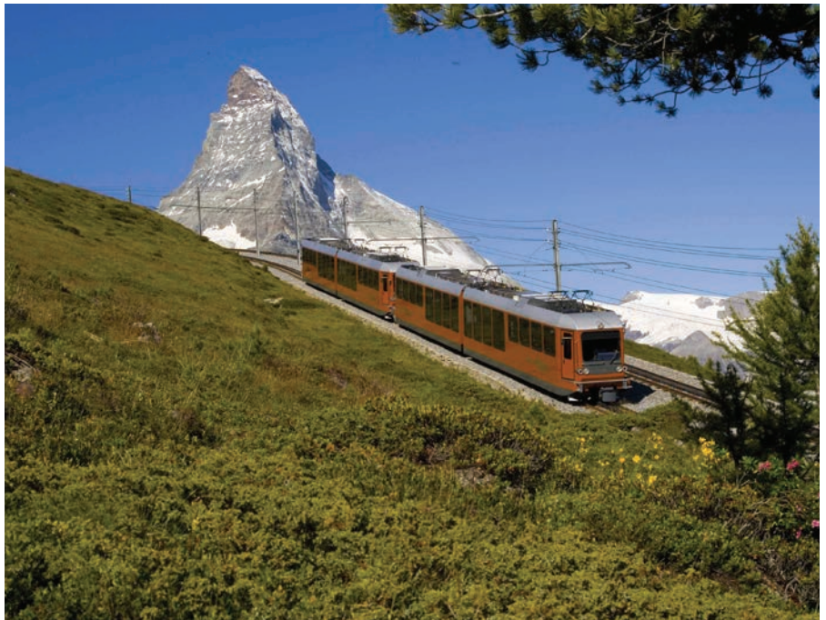
Gornergratbahn above Zermatt