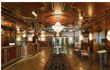
Grand Hotel Zermatterhof lobby

at the end of a day exploring Zermatt. The Alpine Spa is perfect for whiling away a few hours one afternoon or morning; equipped with swimming pool and waterfalls, soothing treatment rooms, a cosy lounge, an intriguing ice grotto, and a range of saunas that promote different aspects of wellbeing. Guests are sure to finish their stay here feeling rejuvenated and revived. The Grand Hotel Zermatterhof is recommended for those looking for a relaxing, indulgent few nights at the foot of some of Switzerland's most popular mountains.