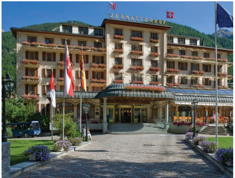
Grand Hotel Zermatterhof

at the end of a day exploring Zermatt. The Alpine Spa is perfect for whiling away a few hours one afternoon or morning; equipped with swimming pool and waterfalls, soothing treatment rooms, a cosy lounge, an intriguing ice grotto, and a range of saunas that promote different aspects of wellbeing. Guests are sure to finish their stay here feeling rejuvenated and revived. The Grand Hotel Zermatterhof is recommended for those looking for a relaxing, indulgent few nights at the foot of some of Switzerland's most popular mountains.